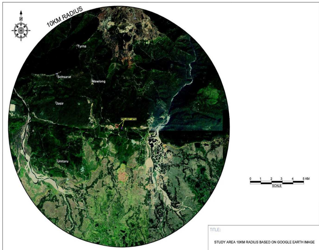
Figure 2 10 km Radius Map around the Project Site